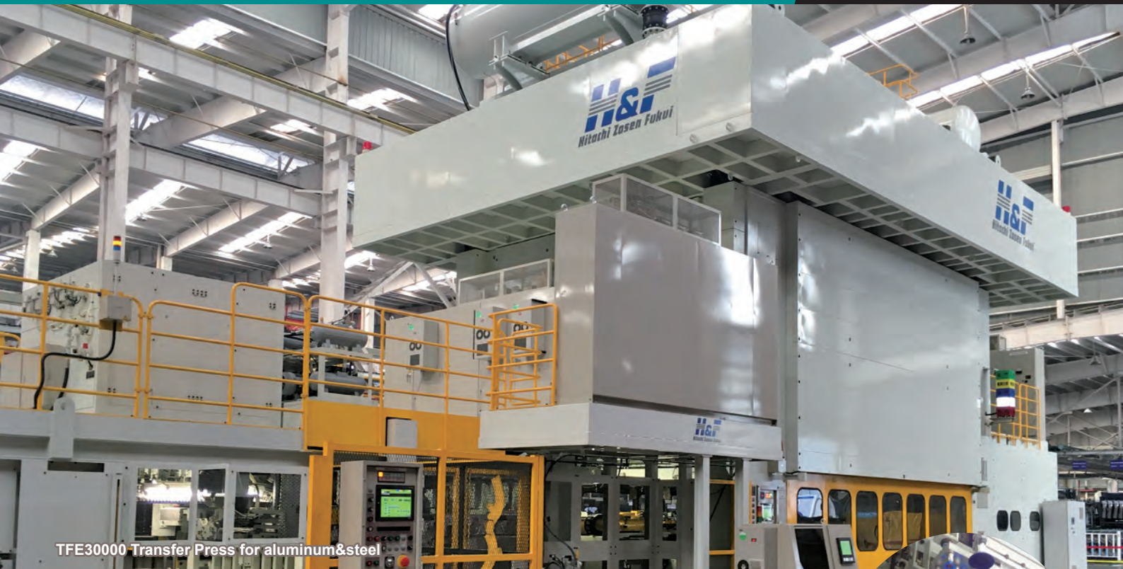
TFE30000 Transfer Press for aluminum&steel