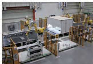
Vision auto palletizer