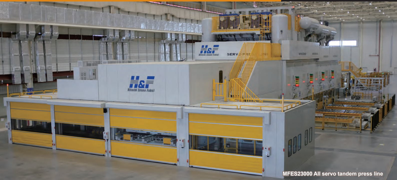
MFES23000 All servo tandem press line